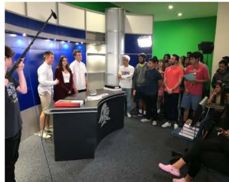
FOOTHILL TELEVISION STUDIO